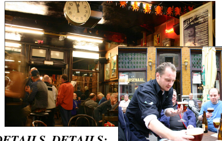
Den Engel Oud Arsenaal

Other pubs worth a visit are the Berenbak , the Waagstuk and the Highlander , all to the NE of the Grote Markt. All serve a good range of Belgian beers, and the Berenbak does a good steak. See www.adrianbell.co.uk .